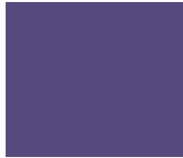
SW 6983 Fully Purple