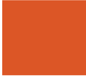
SW 6884 Obstinate Orange