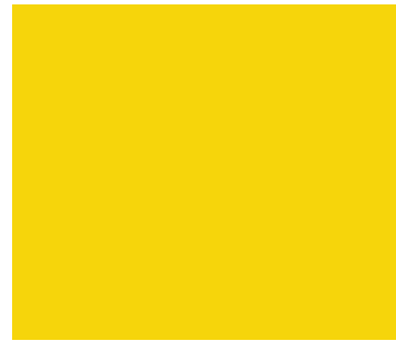
SW 6911 Confident Yellow