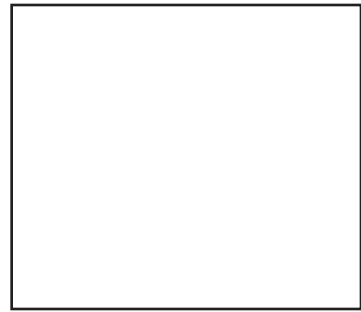
HC 148 Extra White