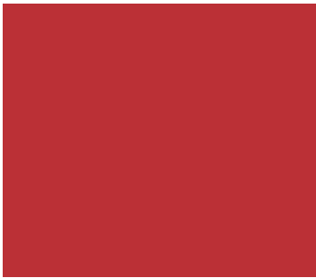
SW 6865 RGypsy Red